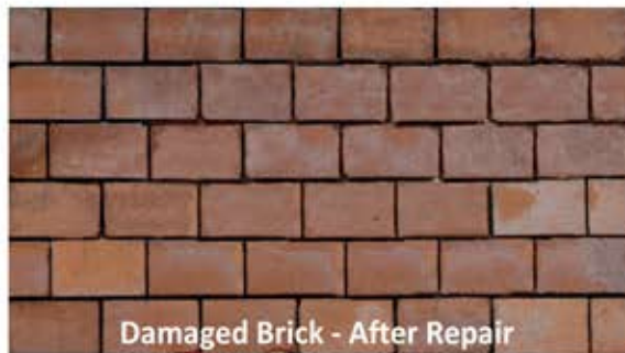
Damaged Brick - After Repair

A high-performance multi purpose filler providing a cost effective alternative to replacing damaged bricks.