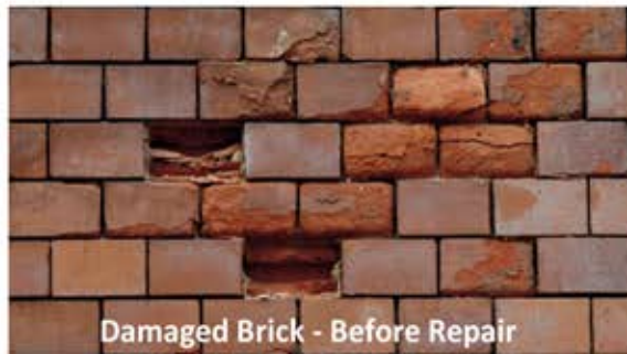
Damaged Brick - Before Repair